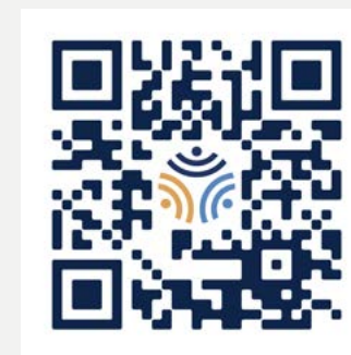
Menu of Possible Commitments