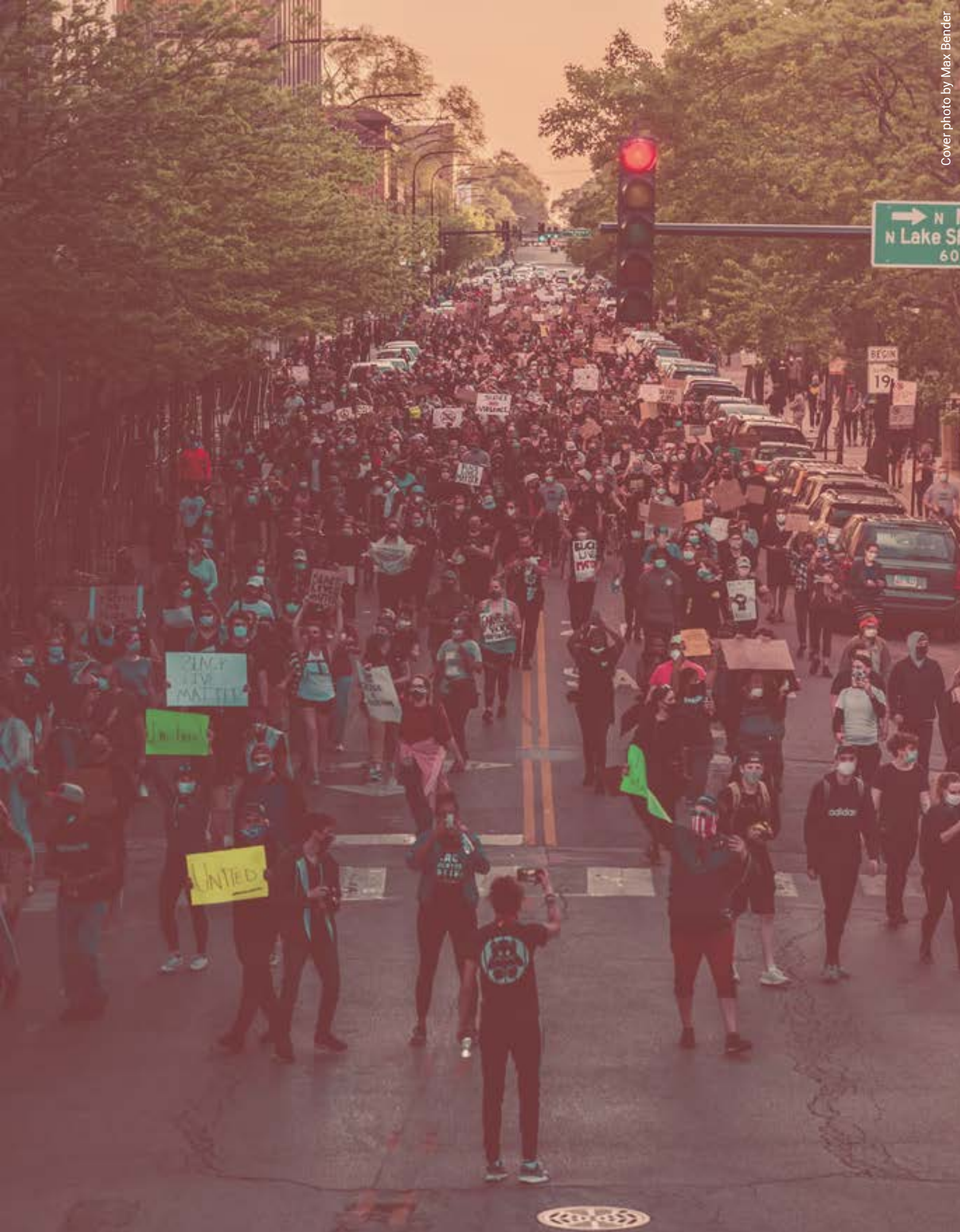
Cover photo by Max Bender